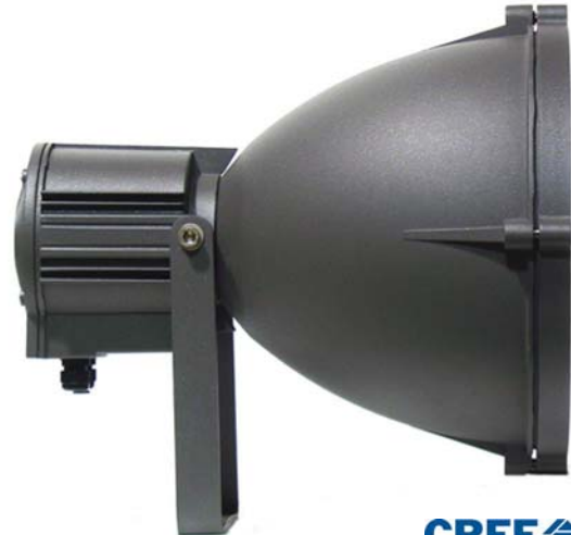
Made in the U.S.A.