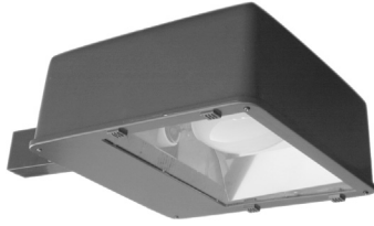
Suitable for wet locations Lamp included

Effective Projected Area EPA = 1.0 SQ. FT. WEIGHT = 35 lbs max.