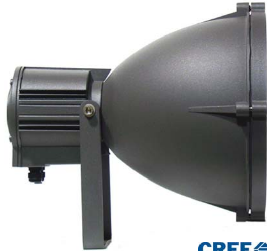
Made in the U.S.A.