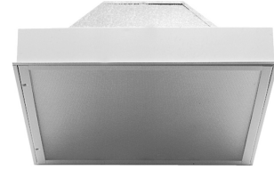
Lamp not included

Racquetball, handball and squash courts.